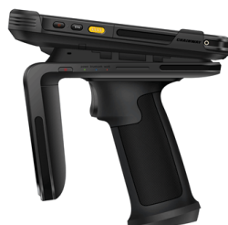
UHF Sled Reader